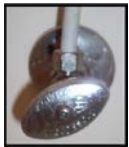
Water Shut off Valve

Test 3: Determine What Part is Leaking. Turn off the water supply at the base of the toilet. Draw a line on the tank at the water level. Wait another hour. If the water level drops below the line, the problem is the flush valve or flapper. If the water level stays the same, the leak is the refill valve or float.