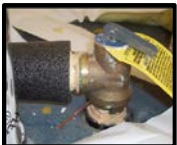
Pressure Relief Valve

Tip: If a faucet or pipe drips 1 drop per second it will waste 2,700 gallons of water a year!